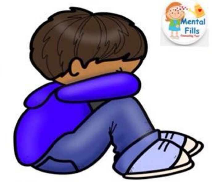
how to be safe